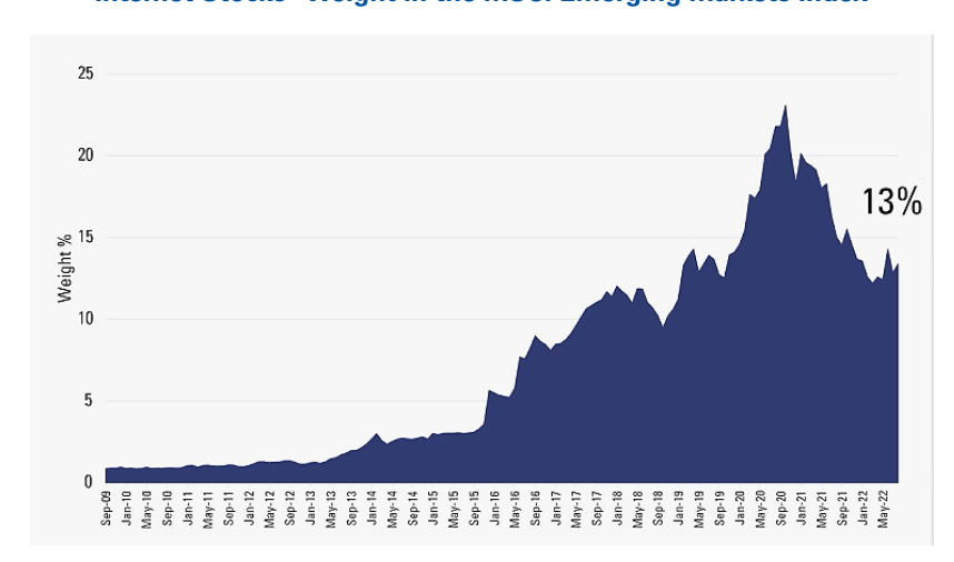
Internet Stocks* Weight in the MSCI Emerging Markets Index

And this graph here illustrates some of that overoptimism that you've seen in emerging markets with the presence of these Internet companies. So if you go back to 2009, essentially Internet companies had a very nascent allocation in the emerging markets index, and that increased all the way to 23% in the 2000 teens, and now it's back down to 13% at this point. So just as you had that overoptimism for tech in Internet in the United States, you also saw similar optimism represented in the emerging market space as well. And what that meant over the longer term time period was added, and that certainly coincided with an increasing valuation for these Internet companies in the emerging market space, to the point that really we just had an underweight allocation to them because they were just too overpriced for us.