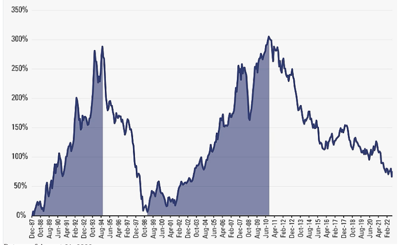
MSCI Emerging Markets Index less MSCI World Index Cumulative Relative Performance January 1988 through August 2022

First, lets take a look at the longer term performance. The graph that you're looking at now illustrates the performance of the MSCI Emerging Markets Index over the MSCI World Index going back to 1988, when the blue line is moving up. It means that the MSCI Emerging Market Index is outperforming the MSCI World Index. And when it's moving down, it means that the MSCI World Index is outperforming the MSCI Emerging Markets Index. Essentially, there's two takeaways from this graph. Number one is when you go all the way to the right hand side, at the end of the day, which is through the end of August, the MSCI Emerging Markets Index has outperformed the MSCI World Index by 67%. Most people don't realize that because they're only focused on the returns over the past ten years. And the other takeaway is that there's a lot of volatility in the performance of this graph. However, the higher volatility doesn't diminish the diversification benefits of allocating to emerging markets.